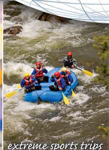
extreme sports trips