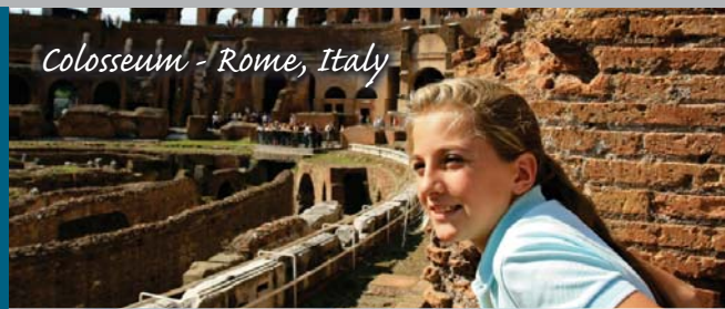
Colosseum - Rome, Italy

With medical coverage from 5 days to 1 year, the Atlas Travel plan from HCC Medical Insurance Services (HCCMIS) is with you almost anywhere on the planet you may travel for vacations, studying abroad, corporate travel, mission trips and extreme sports adventures.